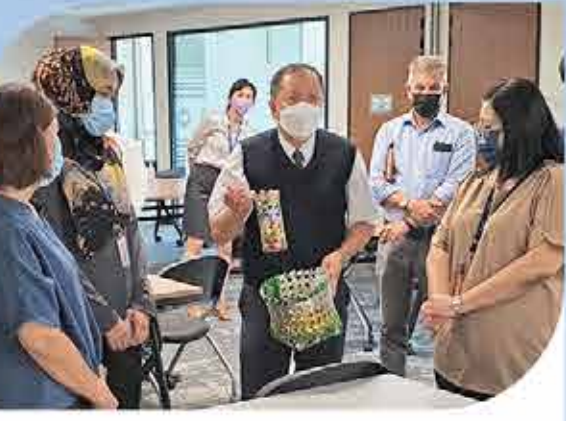
Tackle plastic waste by upcycling drink packs and sachets into useful baskets. But make sure you clean and dry them first.